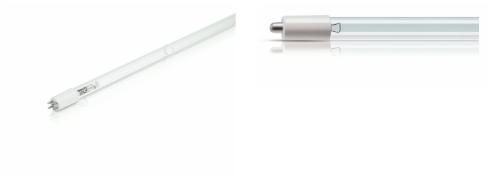
XPPR XUTUV 0004