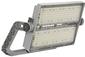
OptiVision LED gen3 5 BVP518 BV PP