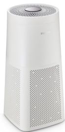
UVCA200 UV-C Floor standing air unit