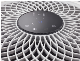
UVCA200 UV-C Floor standing air unit