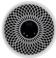
UVCA200 UV-C Floor standing air unit