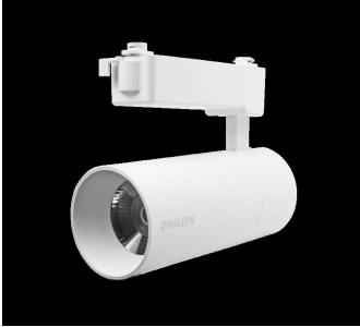
Essential SmartBright Projector 30W