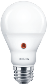
LEDbulb E27 A19